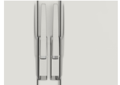
Retro Back Bar Handle

Give us a RAL number and we'll paint your retro refrigerator to match any colour you can dream of.