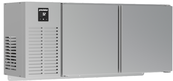
HWU211-UDD with optional solid doors

Waste Heat Recovery Condensate Vaporiser System